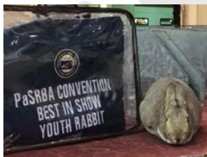
PTA SilverBack Silver