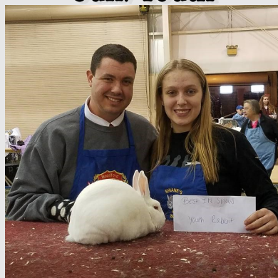
Shy's Wonder Why SB37